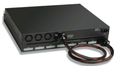
Figure 2. EPS4000 connected to ICX 7240-24P