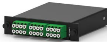
Example of LGX Module with LC adapters