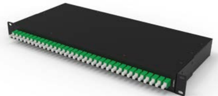
Example of 1RU Panel with SC adapters